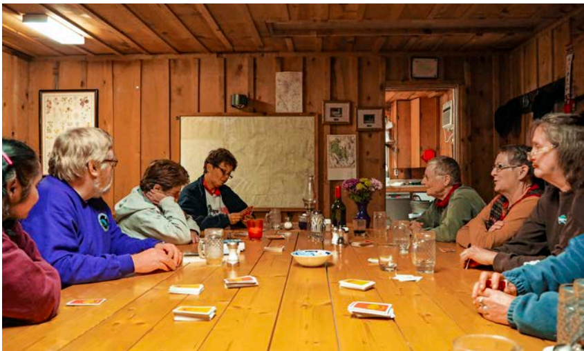
Board games are another evening pastime at the ranch. This Apples to Apples game got quite lively.