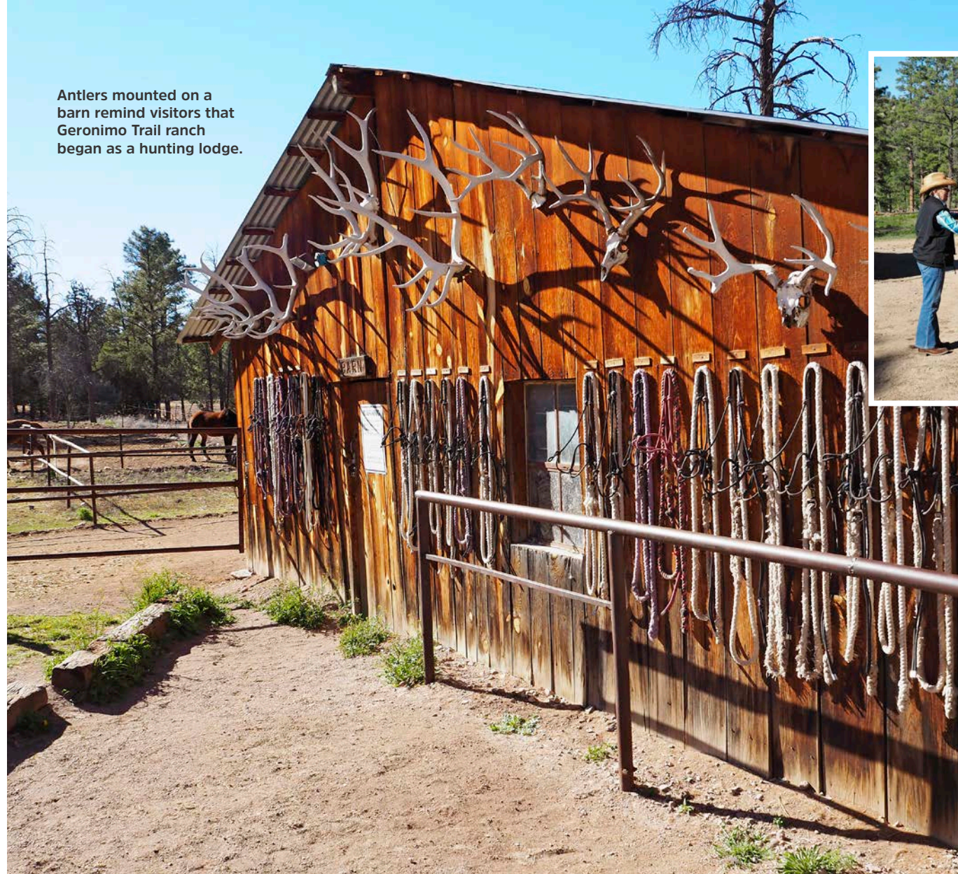
Antlers mounted on a barn remind visitors that Geronimo Trail ranch began as a hunting lodge.