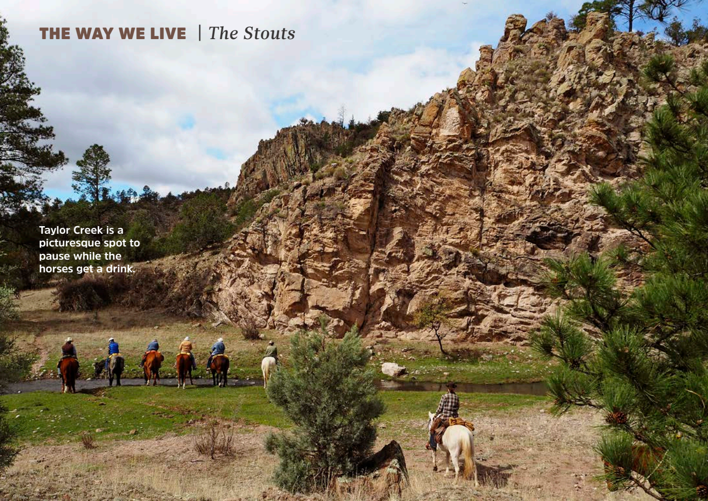
Taylor Creek is a picturesque spot to pause while the horses get a drink.