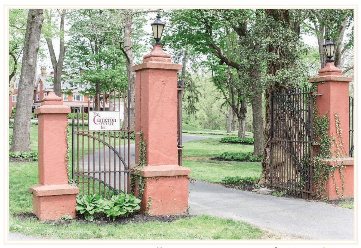
Historic Elegance and Timeless Beauty